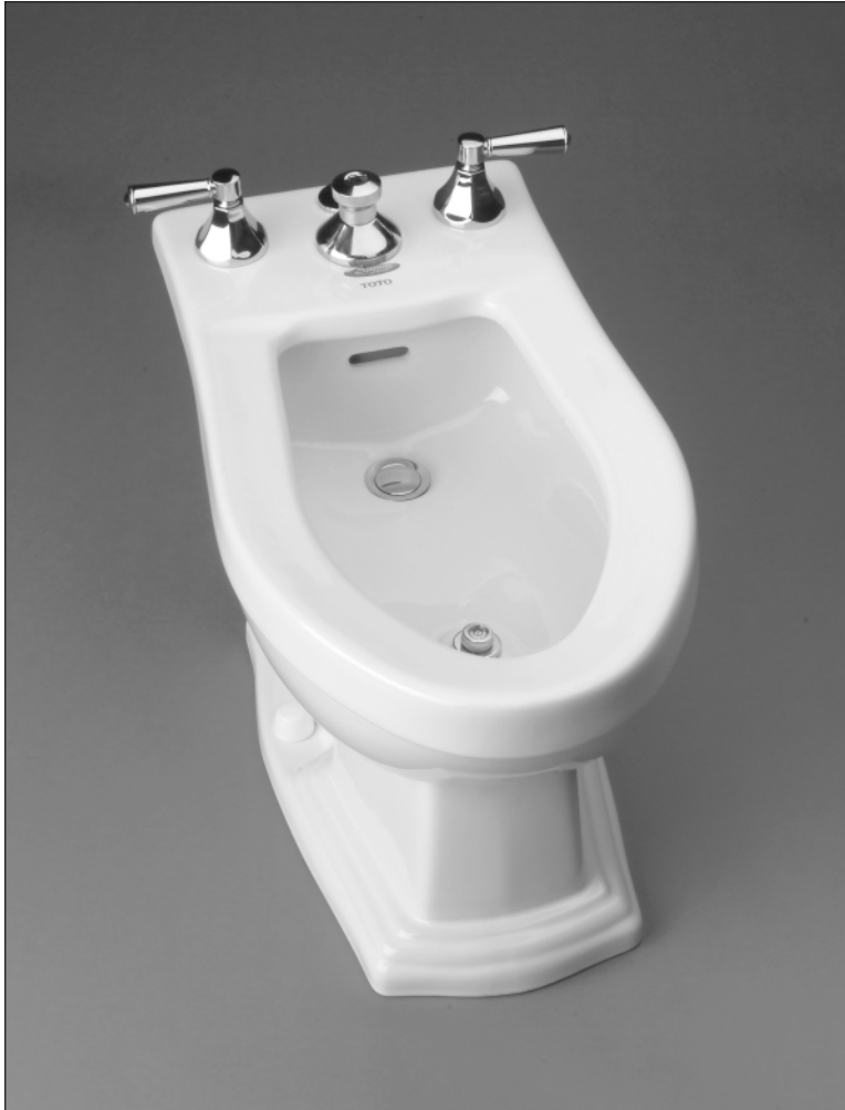
BT784B - Clayton™ Bidet